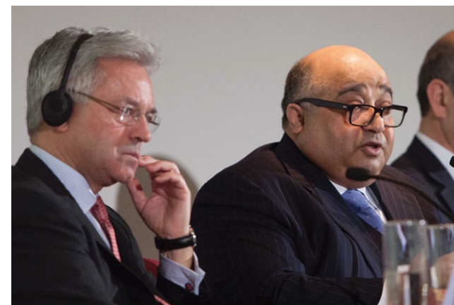
Sir Alan Duncan & HE Sheikh Mohamed Bin Issa Al Jaber