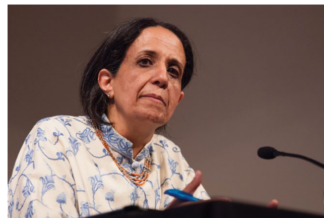
Her Excellency, Ms. Amat al-Alim Alsoswa, Yemen's first woman minister